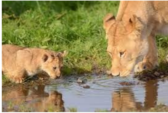
Woburn Safari park