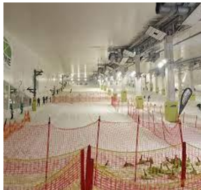
SNOWZONE Milton Keynes