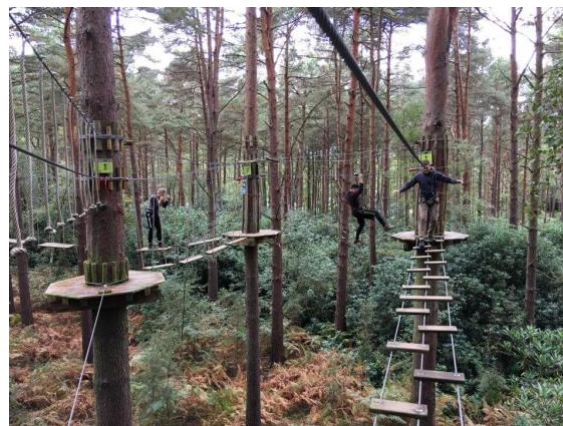
GO Ape Wendover Woods