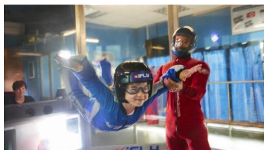
Xscape Skydiving Indoor Centre